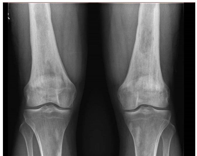
Figure 2 Plain radiographs showing irregular thickening of the cortices, a striated appearance of the lower femora, with areas of sclerosis and patchy lucency.

To further investigate the aortic wall thickening, an ^{18}F -FDG PET/CT was performed which revealed no evidence for FDG avidity in the vasculature.